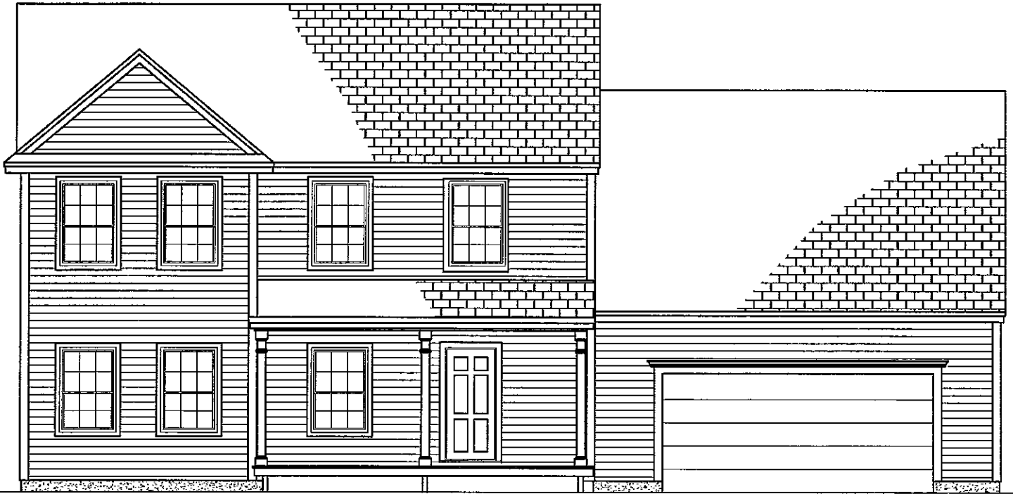
○ FRONT ELEVATION N.T.S. 1,880 SQUARE FOOTAGE