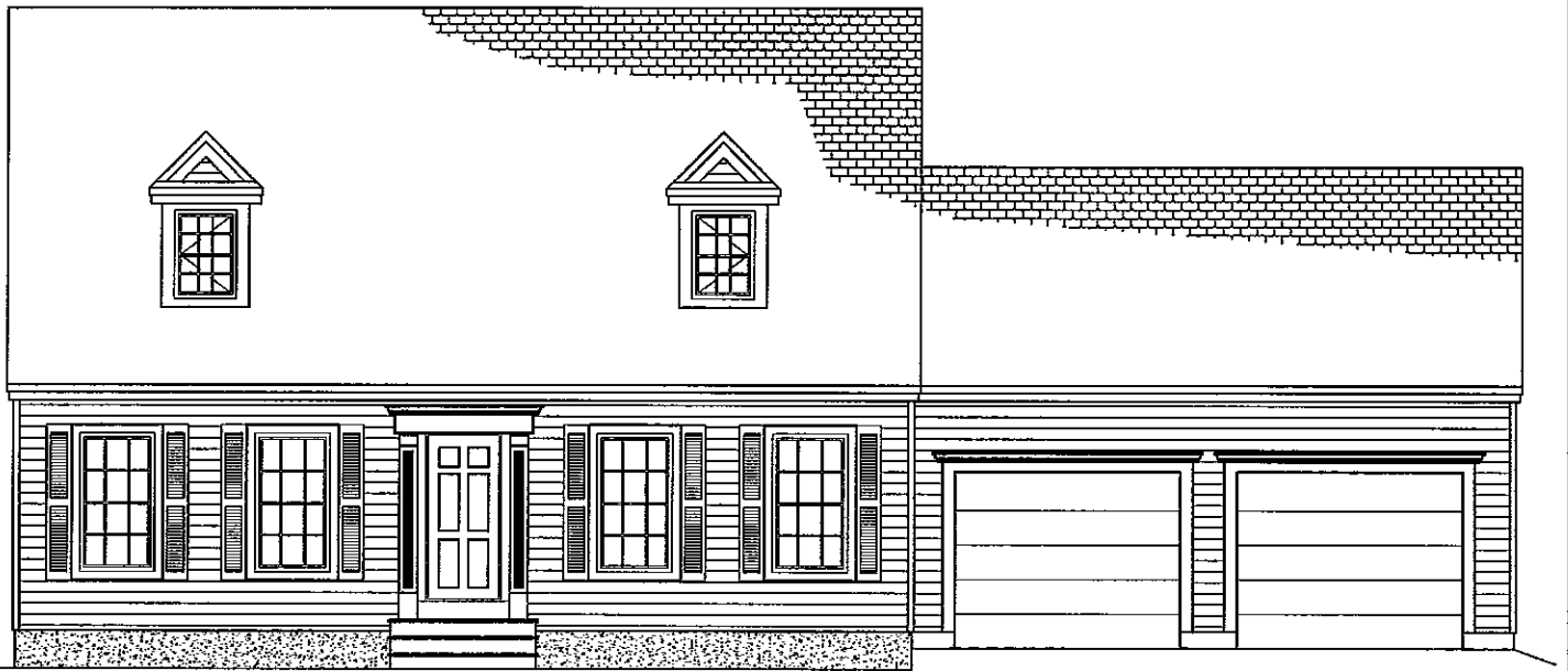
○ FRONT ELEVATION N.T.S. 1,903 SQUARE FOOTAGE