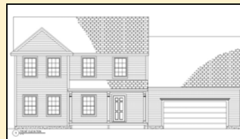
THE WINTER HARBOR

Fabulous open kitchen, dining and living room. Kitchen pantry, mudroom, den, Master BR suite, laundry room on 2 nd floor and a two-car garage.